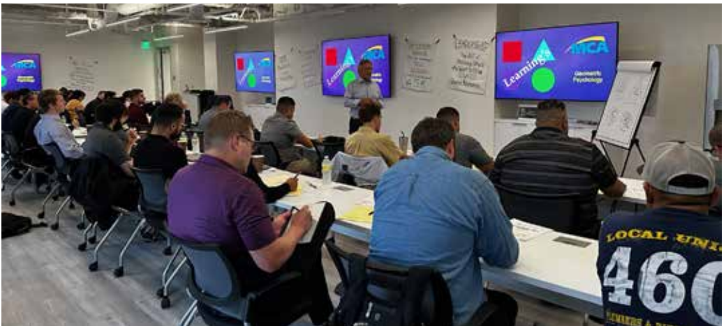
Industry professionals training at the CPMCA Facility in downtown Los Angeles