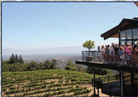
CPMCA ladies enjoy wine-tasting adventures on a balcony overlooking the San Francisco Bay.