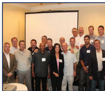
The Affiliate/Associate Members: generous Retreat Sponsors.