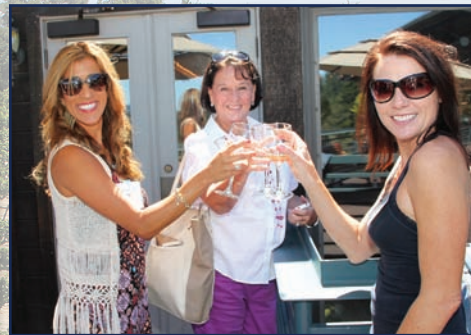
Cheers to friends and good times!