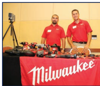
Milwaukee Tool reps unveil the company's line-up of high-powered equipment.